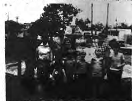
CLEAN UP: On Saturday, May 22, ten members of the 4-H Mid Island Council, volunteered several hours of their time to clean up the west side of Broadway.