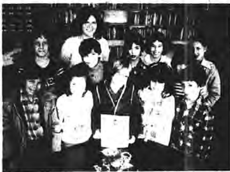
The pupils of the Dutch Lane Elementary School created their own local government to coordinate certain social activities and to help each other respect the rights and privilege of others.