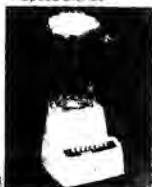
Waring 7-Speed Blender