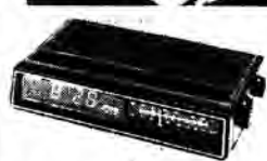
Seville L.E.D. AM/FM Clock Radio