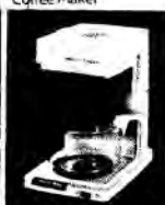
Proctor 10-Cup Coffee Maker