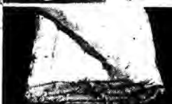
New Haven Double Bed Comforter (Vanilla)