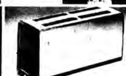
Proctor 4 Slice Toaster

*Withdrawals from All-Savers Tax-Free Certificates and Money Market Certificates of Deposit prior to maturity, with the permission of the bank, are subject to substantial penalties required by Federal Regulations and deduction of bonus gift or cash. Offer good while supplies last. All selections first!