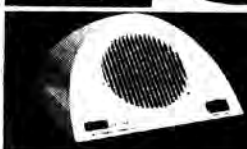
Pollinex Fresh Air Room Freshener