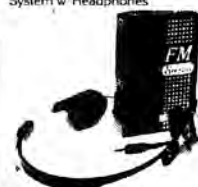
FM Stereo Sound System w. Headphones