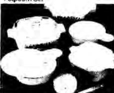
Corning 10 Pc. Potpourri Set