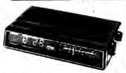
Seville LED AM/FM Clock Radio