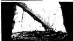
New Haven Double Bed Comforter (Vanilla)