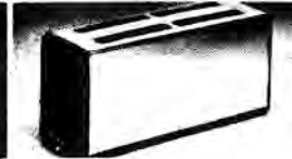
Proctor 4-Slice Toaster

*Withdrawals from All-Savers Tax-Free Certificates and Money Market Certificates of Deposit prior to maturity, with the permission of the bank, are subject to substantial penalties required by Federal Regulations and deduction of bonus gift or cash. Offer good while supplies last. All selections final.