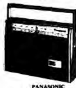
PANASONIC PORTABLE AM/FM RADIO

For any deposit from $2,000-5,000** choose from these gifts: NORTHERN 1200-WATT FOLDING HAIRBLOWER SPARTUS L.E.D. ALARM CLOCK CORNING TEAPOT CREDIT CARD CALCULATOR 100-PAGE DELUXE PHOTO ALBUM