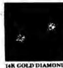
14K GOLD DIAMOND EARRINGS