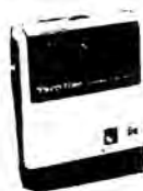
KODAK PARTY TIME INSTANT CAMERA

For a $10,000 6-month C.D.* or a $5,000 30-month Money Market Savings Certificate* choose from these gifts (or $20 cash):