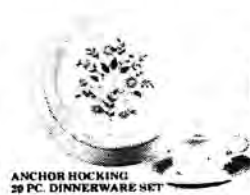
ANCHOR HOCKING 29 PC. DINNERWARE SET