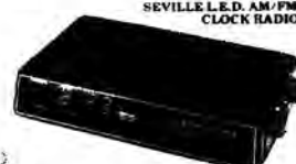
SEVILLE L.E.D. AM/FM CLOCK RADIO