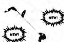
BLACK & DECKER GRASS TRIMMER