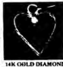
14K GOLD DIAMOND HEART PENDANT

And Eastern will also give you a fine Cross Pen if you open a personal checking or N.O.W. account.