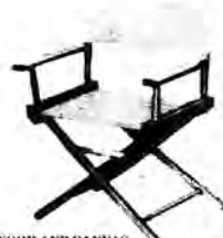
WOOD AND CANVAS DIRECTOR'S CHAIR