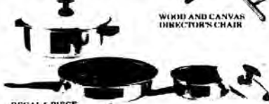
REGAL 5-PIECE SILVERSTONE COOKWARE