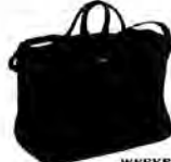
WEEKEND TOTE BAG