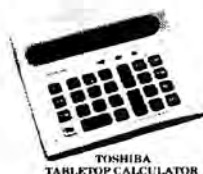
TOSHIBA TABLETOP CALCULATOR

For any deposit from $2,000-5,000** choose from these gifts: NORTHERN 1200-WATT FOLDING HAIRBLOWER SPARTUS L.E.D. ALARM CLOCK CORNING TEAPOT CREDIT CARD CALCULATOR 100-PAGE DELUXE PHOTO ALBUM