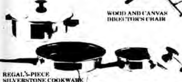
REGAL'S PIECE SILVERSTONE COOKWARE