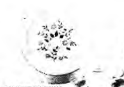
ANCHOR HOCKING 20 PC. DINNERWARE SET