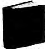
100-PAGE DELUXE PHOTO ALBUM

For a $10,000 6-month C.D.** or a $5,000 30-month Money Market Savings Certificate** choose from these gifts (or $20 cash):