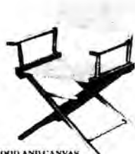
WIND AND CANVAS DIRECTOR'S CHAIR