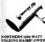
NORTHERN 1200-WATT FOLDING HAIRBLOWER

For any deposit from $2,000-$5,000* choose from these gifts: