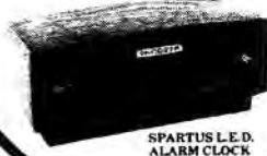
SPARTUS L.E.D. ALARM CLOCK