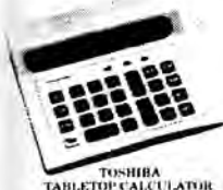
TOSHIBA TABLETOP CALCULATOR

For a $10,000 6-month C.D.** or a $5,000 30-month Money Market Savings Certificate** choose from these gifts (or $20 cash):