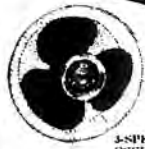
3-SPEED 12" OSCILLATING FAN

And Eastern will also give you a fine Cross Pen if you open a personal checking or N.O.W. account.