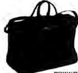
WEEKEND TOTE BAG