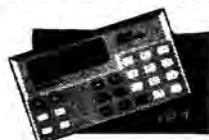
CREDIT CARD CALCULATOR