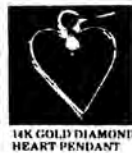
14K GOLD DIAMOND HEART PENDANT