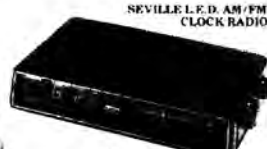
SEVILLE L.E.D. AM/FM CLOCK RADIO