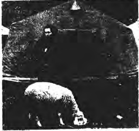
SAN GREGORIO MAGNO - here we see a woman at the site of the earthquake standing in front of her tent with her last remaining possession - a little lamb.

A local bank account has been opened for this fund, and, whatever the amount becomes, every dollar will be distributed directly to the needy families of San