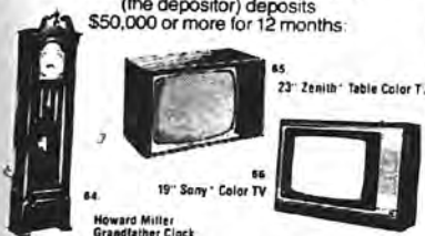
84 Howard Miller Grandfather Clock

Take your choice when your friend (the depositor) deposits $50,000 or more for 12 months: