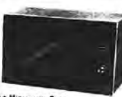
70 Tappan® Microwave Oven