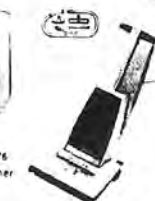
76 Hoover® Vacuum Cleaner