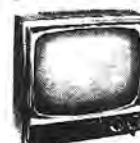
77 15" G.E. B&W Portable TV

Take your choice when your friend (the depositor) deposits $10,000 or more for 12 months: