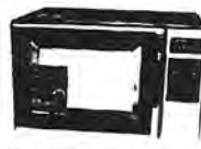
68 Panasonic® (Genius II) Microwave Oven