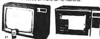
57 19" Quasar® Color TV w Remote

Take your choice when your friend (the depositor) deposits $40,000 or more for 12 months: