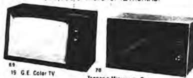
69 19" G.E. Color TV

Take your choice when your friend (the depositor) deposits $30,000 or more for 12 months: