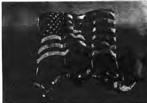
U.S. Army Field Band and Soldiers Chorus.