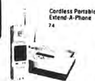
74 Cordless Portable Extend-A-Phone