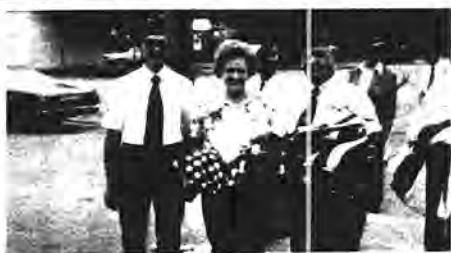
Members of the Charles Wagner Post 421, Hickville American Legion, marked this Flag Day with a ceremony involving a tribute to the National Colors and a demonstration of the proper public disposal of worn out flags.

Ready to place tattered flags on a pyre, after a fitting inspection by post officers, a