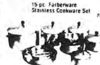
76 15 pc Farberware Stainless Cookware Set