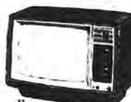
73 13" G.E. Color TV

Take your choice when your friend (the depositor) deposits $20,000 or more for 12 months: