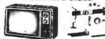
71 17" G.E. Color TV

Take your choice when your friend (the depositor) deposits $25,000 or more for 12 months: