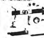
72 Brother Sewing Machine