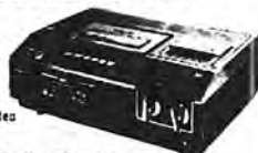
80 Panasonic® 8 hour VHS Video Cassette Recorder

Take your choice when your friend (the depositor) deposits $70,000 or more for 12 months: