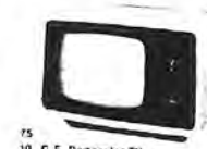
75 10" G.E. Portacolor TV

Take your choice when your friend (the depositor) deposits $15,000 or more for 12 months: