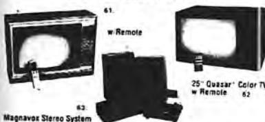
62 Magnavox Stereo System

Take your choice when your friend (the depositor) deposits $60,000 or more for 12 months: