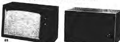
69 19" G.E. Color TV

Take your choice when your friend (the depositor) deposits $30,000 or more for 12 months: