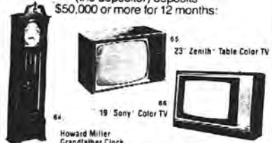
64 Howard Miller Grandfather Clock

Take your choice when your friend (the depositor) deposits $50,000 or more for 12 months: