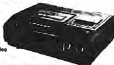
60 Panasonic 6-hour VHS Video Cassette Recorder

Take your choice when your friend (the depositor) deposits $70,000 or more for 12 months: