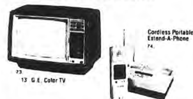
73 13" G.E. Color TV

Take your choice when your friend (the depositor) deposits $20,000 or more for 12 months: