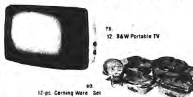
79 12" B&W Portable TV

Take your choice when your friend (the depositor) deposits $10,000 or more FOR ONLY 6 MONTHS: