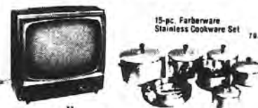
77 15" G.E. B&W Portable TV

Take your choice when your friend (the depositor) deposits $10,000 or more for 12 months: