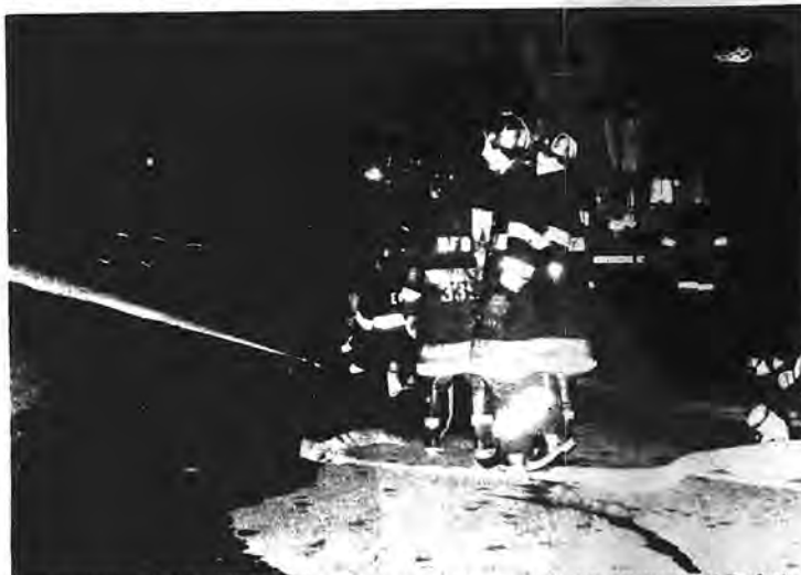
The Hicksville Fire Department responded to a mutual aid call at the Metpar Steel Products building in Westbury on June 13 with one pumper and one tower ladder.