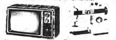
71 17" G.E. Color TV

Take your choice when your friend (the depositor) deposits $25,000 or more for 12 months: