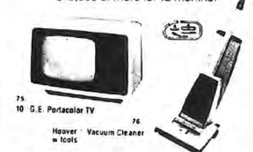
75 10" G.E. Portacolor TV

Take your choice when your friend (the depositor) deposits $15,000 or more for 12 months: