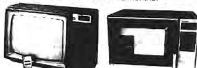
67 19" Quasar Color TV w/Remote

Take your choice when your friend (the depositor) deposits $40,000 or more for 12 months: