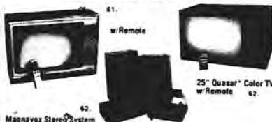
63 Magnavox Stereo System

Take your choice when your friend (the depositor) deposits $60,000 or more for 12 months: