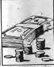
Wages and Salaries

The answer is fuel and taxes. The taxes government charges us and the cost of fuel to produce your electricity are our two biggest expenses—many times more than what we spend on wages and salaries or dividends paid to our common shareholders. In fact, fuel, taxes and interest rates—things we have little control over—take up 73¢ of each dollar paid for electricity.