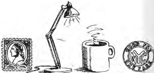
A postage stamp.

Which of the items below do you think went up in cost the most over the past 30 years?