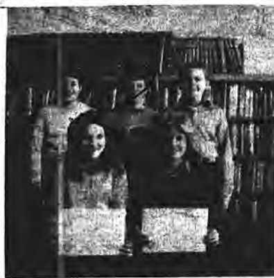
Many Dutch Lane students put their thoughts into words by participating in Hicksville's VFW Voice of Democracy essay contest. In recognition of excellence in their essays, five Dutch Lane students received Certificates of Merit at a festive ceremony held at the V.F.W. on February 25.

PARADE RECEPTION: Members of the Division and Ladies Auxiliary who participated in the Garden City Parade are invited to be guests of the Division at O'Hagan's Irish Inn, 50 East Barclay Street, Hicksville (one block north of the LIRR station) immediately upon our return. A gala afternoon is planned!