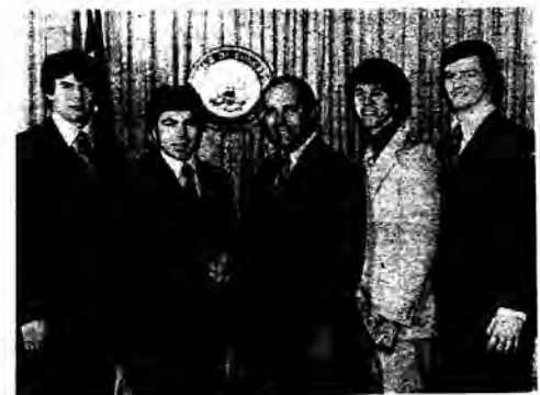
LENT ANNOUNCES HICKSVILLE'S SERVICE ACADEMY NOMINEES: Congressman Norman F. Lent (c) congratulates Hicksville's nominees

Anyone between the ages of 17 and 65, and in good health can be a blood donor. The procedure is safe, painless, and takes just a short while. For more information call LIBS at 752-7300. Give blood, it was meant to circulate.