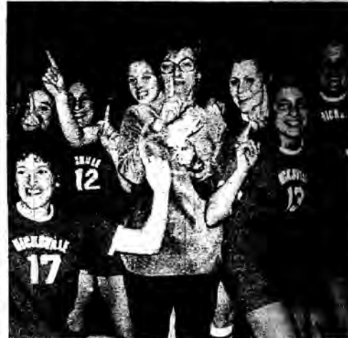
Our 1979 Volleyball Champions