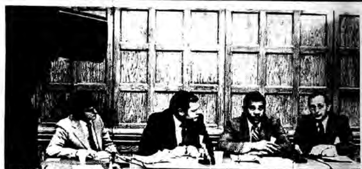
TAX REFORM: Hempstead Town Presiding Supervisor D'Amato, right, who served as moderator on a closed circuit television discussion on Property Tax Reform produced by the Metropolitan Regional Councils

Advance reservations are urged because of limited room capacity. The $40 fee includes reinforcement tape. Reservations may be made by writing to The Apple Core, Red Top Road, Highland, N.Y. 12528; or telephoning (914) 691-8882 and (201) 748-4091.