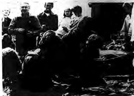
CORN-HUSKING contests are only one of the many lively forms of entertainment set for the Long Island Fair. Everybody's invited to enjoy the annual event, which will be held at the Old Bethpage village restoration for the 8th straight year, Friday through Monday, Oct. 6 through 9, from 10 a.m. to 5 p.m.

The Fair has been sponsored by the Agricultural Society of Queens, Nassau and Suffolk Counties, Inc. since 1842. Complementing the scores of traditional premium contests are many forms of entertainment for visitors of all ages. The corn-husking contests are set for Saturday through Monday, at 12 noon, 1 and 3:30 p.m. Old Bethpage, a mid-19th century working farm community, is operated by the Museum Division of the Nassau County Department of Recreation and Parks. Admission to the Fair is $2.50 for adults and $1.50 for children through age 17.