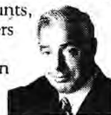
The Bowery Savings Bank, Member FDIC

All these services, in one stop, at convenient Bowery branches.