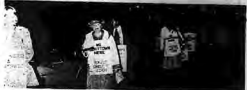
Peaceful Job Action

duty compensation for music, band, orchestra, newspaper and grade advisors; and Comet Shop advisor, among others, for a total of $12,165.00.