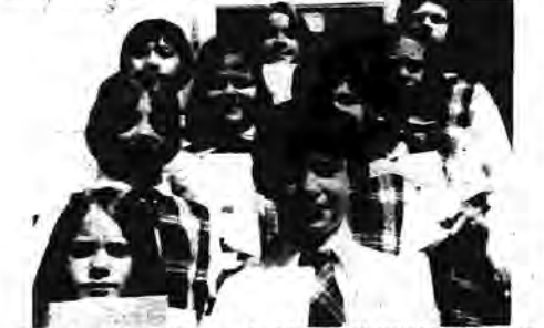
Students at St. Ignatius Loyola School participated in this year's Young Authors Festival, sponsored by the Diocesan Education Department. Students in grades four, five and six wrote, illustrated and bound their own manuscripts. Thirty-one entries from our school were submitted to the contest.