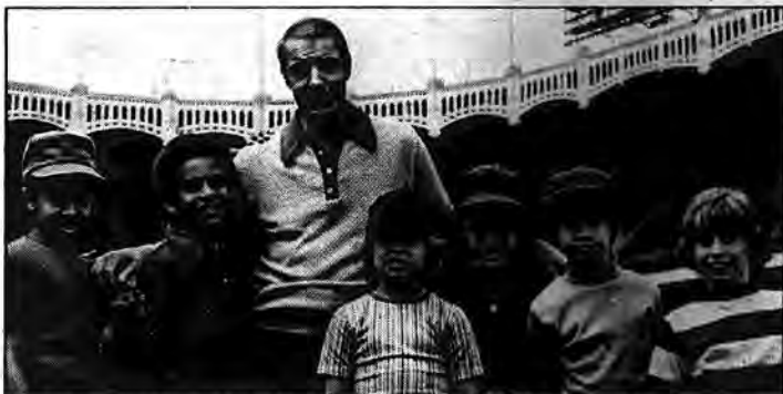
This photograph is a collector's item. It was taken a few years ago in the "old" Yankee Stadium. The stadium has been renovated, but the message below has not changed.

WE 1-0241 WE TELEGRAPH AND DELIVER FLOWERS