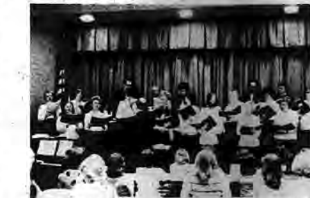
The Hicksville Community Chorus at a concert given by the Chorus recently at the Willet Avenue School for the PTA.