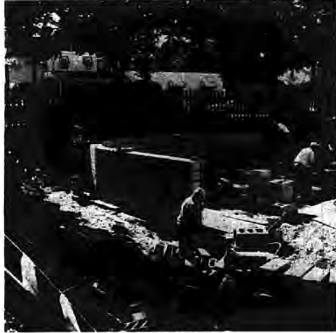
August of 1961

Regular Sunday services are held at 8 and 10 A.M. with nursery care and Church School provided at 10 A.M.