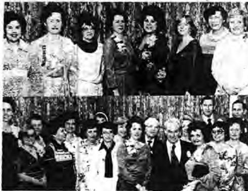
The Dinner Committee (in the upper picture) and the Unit Honored Guests in the lower picture.