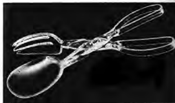
or Handy Lucite SALAD TONGS

Regular 5 1/4% dividend is earned on the money in your club account, compounded daily from day of deposit and credited quarterly, provided $1 balance is maintained until end of quarter. A check representing the total of deposits and interest it earned will be mailed to you in October.