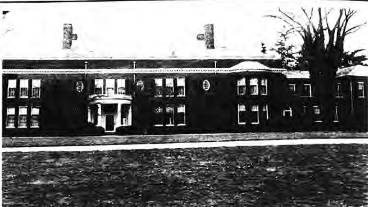
WELWYN ESTATE in Glen Cove, for which the Nassau County Board of Supervisors approved the appropriation of $2 million in bonds at its Monday, Nov. 14th meeting. This amount together with $1 million previously authorized by this Board, constitutes the offer to a group of six who own this estate.

"For the good that needs assistance For the bad that needs resistance For the future in the distance And the good that we can do."