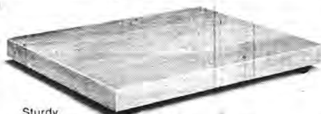
Sturdy Hardwood Gourmet 7" x 9" CHOPPING BLOCK

when you open a $5, $10 or $20 weekly club account.