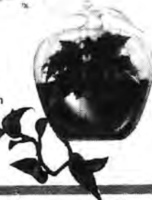
Decorator-Quality Hand-Blown Glass ROOTER (plant not included)