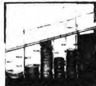
Free Coin Bank

Free banks available at Chase in Syosset ... the Plainview branch at 365 South Oyster Bay Road ... and our Levittown branch in the Nassau Mall, 3601 Hempstead Turnpike.