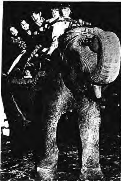
Ballyhooed as "5,000 pounds of love", Bolivar, a 14-year-old Indian Elephant, will be one of the featured attractions of the Long Island Fair, Oct. 7 through 10, at the Old Bethpage village restoration.

Adventurers of all ages are welcome to mount the gaily decorated howdah on the mighty back of this majestic pachyderm for 50¢ a ride.