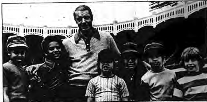
This photograph is a collector's item. It was taken a few years ago in the "old" Yankee Stadium. The stadium has been renovated, but the message below has not changed.

"Who says you have to be rich to send your kids to college, take a great vacation, and retire?" - Joe DiMaggio