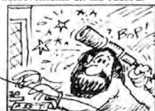
Galileo was the first astronomer to use the telescope.