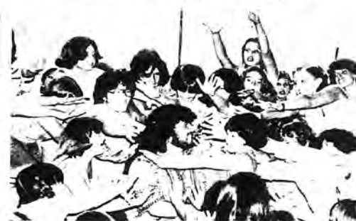
"Jesus Christ, Superstar" will be presented at St. Ignatius R.C. Church in Hicksville, on Friday, Aug. 26, and run for two weeks.

The youth of Long Island have gathered to work together on a production, guaranteed to bring joy & happiness to the hearts of many. On Friday, August 26 "JESUS CHRIST SUPERSTAR" will open for a 2 weekend run at St. Ignatius Parish in Hicksville. The performances are at 8 p.m. and admissions are $2 - adults & $1 - children under 12. In June kids from all parts of