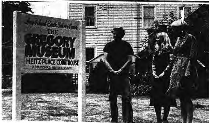
NEW LOOK: The Gregory Museum, Long Island's Earth Science Center, is sporting a New Look these days with the addition of New Signs placed around the "old courthouse", proclaiming