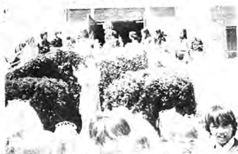
Children of Our Lady of Mercy School participate in the "Crowning of Mary as Queen of Heaven and Earth" ceremony.

On Thursday of last week, a special liturgy was held for all the teachers, children and many parents of Our Lady of Mercy School. After the Mass, celebrated by all the Priests of