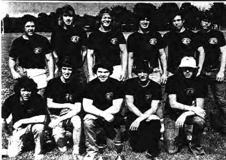
HICKSVILLE SOFTBALL TEAM, THE UNKNOWN ARE NOW WELL-KNOWN TO MEMBERS OF 26 OTHER SOFTBALL TEAMS OVER WHOM THEY TRIUMPHED TO WIN THE Sixth Annual Nassau County Boys' Softball Tour-

nament in Eisenhower Park, co-sponsored by the County's Department of Recreation and Parks and the European American Bank. The Unknowns came from behind to win a squeaker from the Colts of North Merrick, 9 to 8. Players (l. to r.)