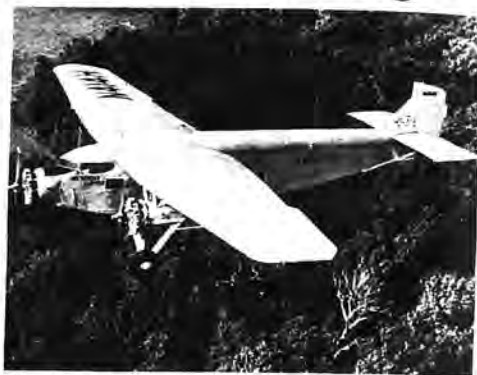
A FORD TRI-MOTOR, the first all-metal plane ever built, is shown in actual flight today on one of its barnstorming tours. The plane will be one of the star attractions at Nassau County's "Salute to Lindbergh" Air Show May 21-22 at Nassau Beach in Lido.