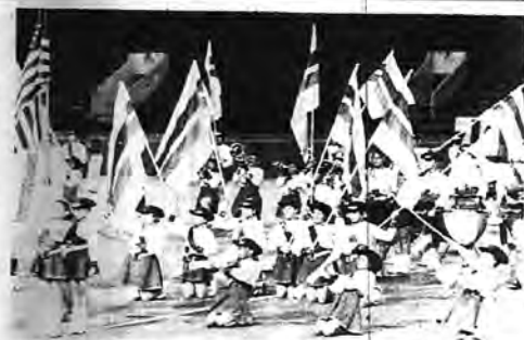
SPRING DANCE: The Twelfth Annual Spring Dance of the Parents Association of the St. Ignatius Girls' Cadet Corps will be held on Saturday evening, April 30th, at the Galileo Lodge Hall, Levittown Parkway, Hicksville. Music will be supplied by The Strangers from 9 P.M. until 1 A.M. The cost per person of $12.50 ($25.00 per couple) includes Rock Cornish Hen Dinner, plus unlimited liquor and beer. Reservations for tables of ten or twelve, if needed, should be made in advance. Please call 433-6708 or 735-4991.