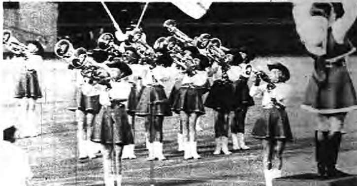
SPRING DANCE: The St. Ignatius Girls Cadet Parents Association will sponsor their 12th annual Spring Dance on April 30, from 9 P.M. to 1 A.M. at the Galileo Galilei Lodge on Levittown Parkway. Tickets are $12.50 per person. There will be a sit-down dinner and unlimited beer and liquor. Music by the Strangers.