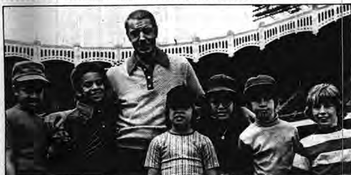
This photograph is a collector's item. It was taken a few years ago in the "old" Yankee Stadium. The stadium has been renovated, but the message below has not changed.

It's Just A Wee Pub In Hicksville Where Old Friends Meet