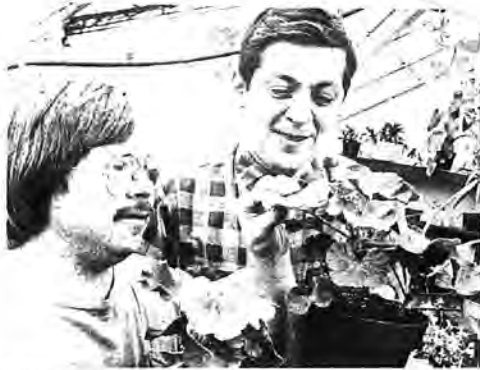
IT'S MARCH and spring can't be far behind. It's been a long winter but the geraniums are starting to bloom at the Association for the Help of Retarded Children's greenhouse on the AHRC campus in Brookville.