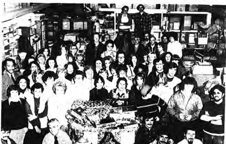
SHARING IS THE SPIRIT OF CHRISTMAS: As a special community project, the employees of Four Star Associates Inc. of Hicksville collected new toys to

GE 3-6145 — HICKSVILLE — 938-0231 935-1157 — PLAINVIEW