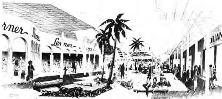
Artist's rendering of the enclosed mall at Mid-Island Plaza, Hicksville, New York, as it will appear after ten authentically designed international "Islands of the World" are completed as part of the innovative design

New ceilings throughout the mall will vary in height and architectural shape to define the "international island" courtyards below, and most of the upper glass areas will be retained to permit natural daylight to enter. Even Mid-Island Plaza's name has been redesigned by the Werfel & Berg firm with distinctive new graphics depicting the "islands" theme that will appear on all signage. Also, special color schemes,