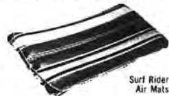
Surf Rider Air Mats