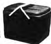
30 qt. All-Purpose Plastic Ice Chests

Independence Getaway Sweepstakes Entry Blanks are available in the Independence Room of the Walt Whitman Office, where Sweepstakes prizes are also on display. You do not have to open an account or make a deposit to enter,