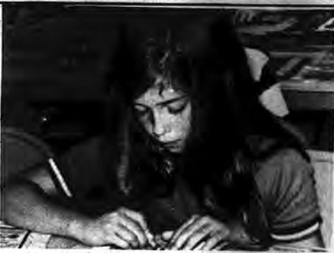
There're lots of things to make, songs to sing, Bible stories and games to play at Vacation Bible School. August 9-22 are the dates at the United Methodist Church of Hicksville on Old Country Road and Nelson Ave. Classes will be