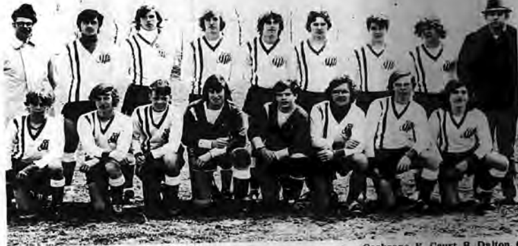
CHAMPS ... The Hicksville American Soccer Club proudly presents its AOH sponsored team which took the Long Island