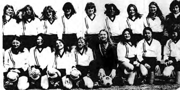
THE HICKSVILLE AMERICAN SOCCER CLUB PROUDLY PRESENTS ANOTHER L.I. JUNIOR SOCCER LEAGUE CHAMPIONSHIP TEAM. THESE GIRLS (under 16)