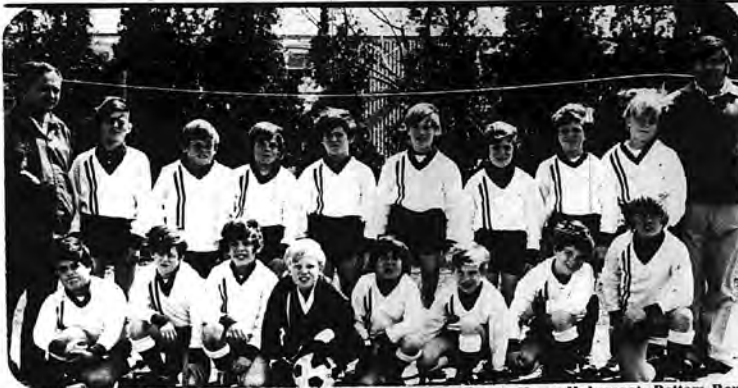
THE HICKSVILLE AMERICAN SOCCER CLUB'S BANTAM BLUE'S maintained the club's reputation by taking SECOND PLACE in their Division at the Willingboro In-