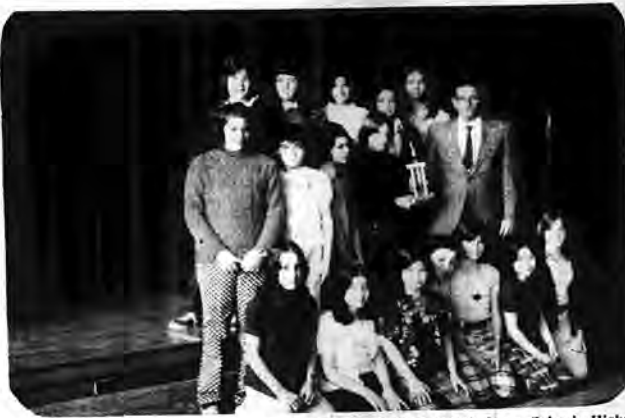
VOLLEYBALL CHAMPIONS: A few weeks ago, the hall of Dutch Lane School, Hicksville resounded with cries of "We did it! We won!" Dutch Lane's girls' volleyball team had defeated the Woodland Avenue School team to become the District Champion.

In the playoffs earlier, the Dutch Lane team defeated Lee Avenue and Burns Avenue. On the day of the final game the gym at Woodland Avenue was filled with spectators from both schools. It was a game with enough excitement and tension for any fan.