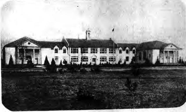
Fifty years of Educational service to the community and nation are being recalled as Hicksville prepares to honor its oldest school building, the Junior High School on Jerusalem Avenue (shown in 1927, in its early years).