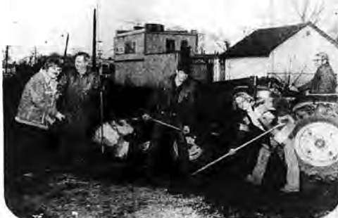
BEAUTIFUL: Community volunteers are hard at work beautifying Hicksville.