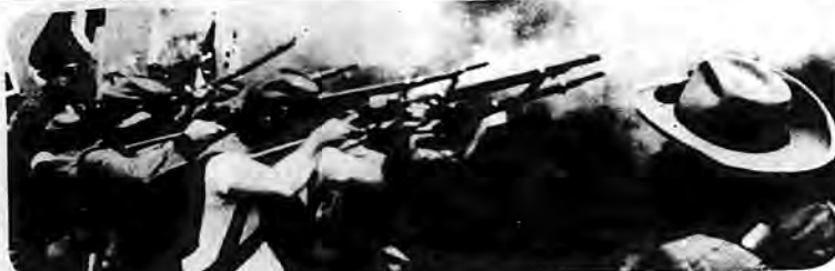
BICENTENNIAL: The 4th Virginia Regiment of the Stonewall Brigade, Civil War buffs, will be a highlight of Hicksville's April 19 program

The Mid Island Plaza Antiques Show and Sale will feature a full range of antiques, from inexpensive items and collectibles to valuable works of art. The show will be open to the public from 10 a.m. to 9:30 p.m. There is no admission charge.