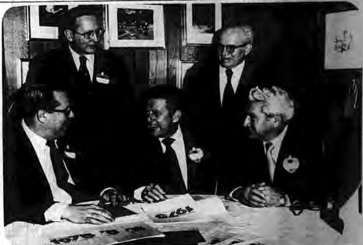
THE BALL IS ROLLING... The 11th Annual Heart Fund Ball will "salute" Nassau County Government and Industry on Saturday, April 19th at the Colton Hill, Hauppauge.