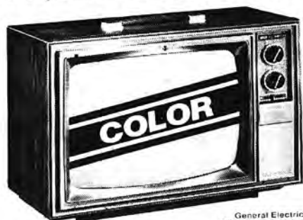
General Electric 19" Color Television

During our two-week Celebration, you can take home a GE 19" Color Television just by following these simple rules... Bring in a friend or relative who is not a member of your household. Have him open a National Bank of North America Time Savings Account (Supreme Savings Certificate) with a $10,000 deposit for 2½ years or a $5,000 deposit for 4 years.