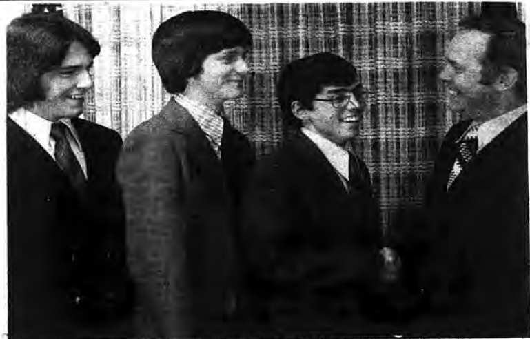
LENT NOMINATES THREE FROM HICKSVILLE FOR SERVICE ACADEMIES: Congressman Norman Lent (right) has announced his nomination of three young men from Hicksville for appointment to the Nation's service academies.