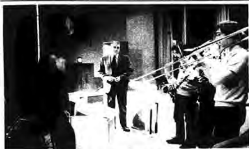
"Swing 'n Things": The Hicksville High School Stage Band presents "Swing 'n Things" on Saturday evening February 2, at 8:30 in the Hicksville High School Auditorium. This is one of the free admission programs