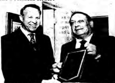
plaque from the LIGA honoring his years of integrity and enterprise in the allied auto industry professions.