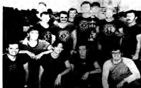
Members of PHIL Co. No. 1 proudly pose, top photo, with their trophy after winning 1st place in H.F.D. Inter-Co. Tournament.