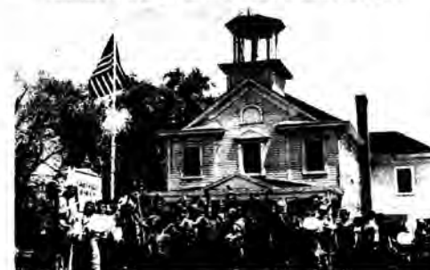
Indians from Troop 158 held a Pow-Wow for all to see.