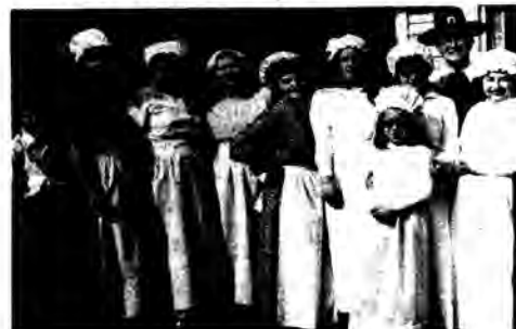
Volunteers from Gregory Museum served as colonial Lass & Lads!