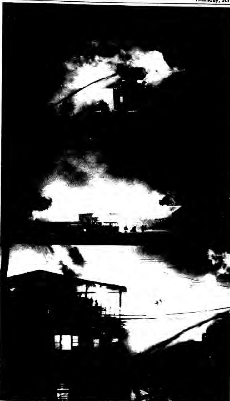
FIREMEN SHOWN HERE, top photo, as they start to battle the blaze. Cause of the blaze is listed as suspicious. Hicksville Barn