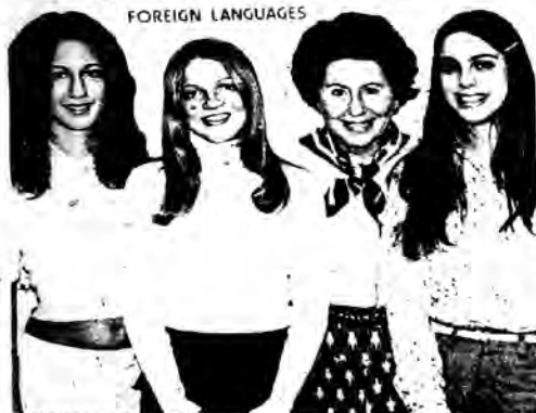
GERMAN STUDENTS: from John F. Kennedy High School were among those students who were winners of the National