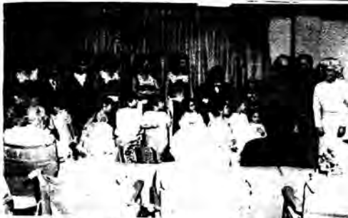
NO GENERATION GAP. Students of the Marge Williams Dance Studio entertained at the central Nursing Home where they were enjoyed so much, they

were asked to come back for a repeat performance. These children range in age from three to seventeen years.