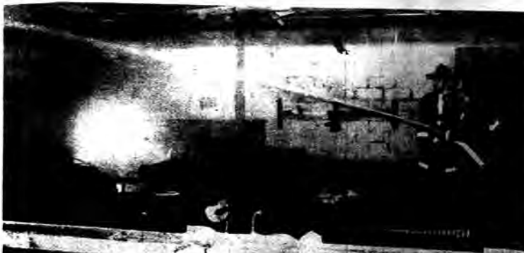
FIRE: At Fern Place March 29th, The Plainview School in Plainview on Fire Department responded to the call.

You Should NOT Purchase any New or Used JAGUAR - MG - TRIUMPH