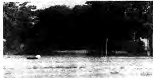
"Another example of the work of your Chamber of Commerce. Through the efforts of the Eyesore Elimination Committee Road has finally been demolished." under the direction of the Rev. Roland Perez, this decrepit and dangerous house located near the Downtown area on Newbridge