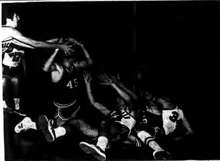
HICKSVILLE's early high status was reduced as the basketball took erratic bounces in

The final night of the tour- (Continued on Page 8)