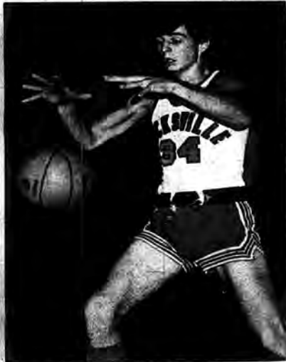
ball, and in the right photo clutch the ball against Trinity.