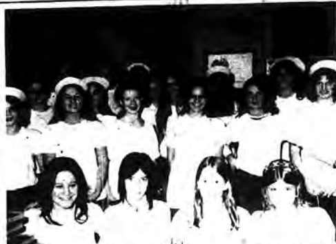
A GROUP of young people called Boyhan's Brigade, 26 young people spreading cheer whenever and wherever they are needed.