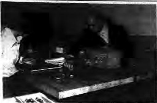
HICKSVILLE HIGH SCHOOL has the distinction of being the first school in New York State to have a unique electricity - electronic laboratory especially designed for those students enrolled in courses where they study the fundamentals of electricity and electronics. The physical lay-out of this laboratory consists of several long tables that are furnished with individual meters, voltage regulators and switches, as well as containing drawers stocked with the necessary wires and

tools. The tables provide 16 individual work stations so that many students can work simultaneously.