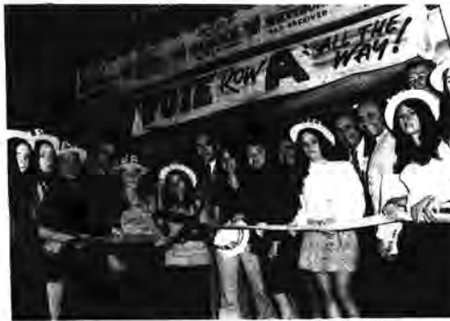
ROW A: The campaign to get voters to vote Row "A" Republican got underway in Hicksville recently when the Town GOP Committee opened Republican Campaign Headquarters at 18 West Marie Street. A host of youngsters joined some of the Town can-

October 15, at 8:00 p.m. The meeting will be held at Republican Headquarters at 18 West Marie Street, Hicksville.