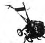
Snapper rotary tiller. Tough, heavy-duty, perfectly balanced. Dependable chain drive. 3 and 5 HP models.