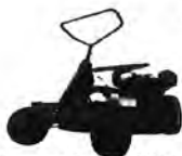
Snapper Comet riding mower. 26" and 30" models. With suitable attachments, it will perform like a garden tractor—at less than half the price.