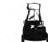
Snapper V-21 and 18. Rotary mower with bag between handles for close-trimming on both sides. Vacuums while it mows.