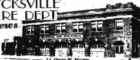
Lt. Owen W. Magee Fire Alarms Dec. 27 thru Jan. 2

12-27-70 1:26 AM - Rubbish fire - Levittown Pky. Shops. 5:15 PM - Car fire - LIRR Station 12-29-70 11:52 AM - Auto Accident - Broadway & Marie St. 4:47 PM - General Alarm - House fire 22 Adams St. 8:06 PM - Malicious False Alarm - Levittown Pky. Shops 10:08 PM - Malicious False Alarm - Levittown Pky & Stewart Ave. 12-30-70 3:52 PM - Rubbish fire - 102 Tec St. 8:50 PM - Ambulance Call for Rescue Squad - 10 Dante St. 12-31-70 1:35 PM - Silent Alarm - Brush Fire - rear 156 Duffy Ave. 1:37 PM - Oil Burner fire - 14 Lantern Rd. 4:15 PM - Silent alarm - Rescue call - 92 W. John St. 1-1-71 1:48 AM - Accidental false alarm - 325 Duffy Ave. 1:37 PM - Oil Burner fire - 14 Lantern Rd. 4:15 PM - Silent alarm - Rescue call - 92 W. John St. 1-2-71 10:43 AM - Accidental false alarm - Grumman Plant 37 11:22 AM - Ambulance call for Rescue Squad - 21 Terrace Pl. 4:22 PM - Truck fire - Duffy & Newbridge Rd. 5:09 PM - Rescue call - Oxygen - 21 Plover La. 5:09 PM - Amb. Call - Transport patient from 21 Plover La. 11:41 PM - Ambulance Call for Rescue Squad - 194 Lee Ave. December Fire Totals Total Alarms received - 74 False Alarms - 12 Rescue Calls - 16