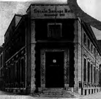
MAIN OFFICE—IN WILLIAMSBURG