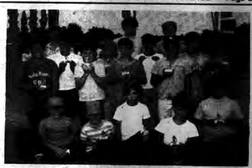
These are the HICKSVILLE RECREATION summer Settle champions from Fork Lane School. Prizes were denated by Goldma Brothers.

that lasts rather the trend styling that doesn't. So he keeps his staff well aware of the individual needs of each customer.