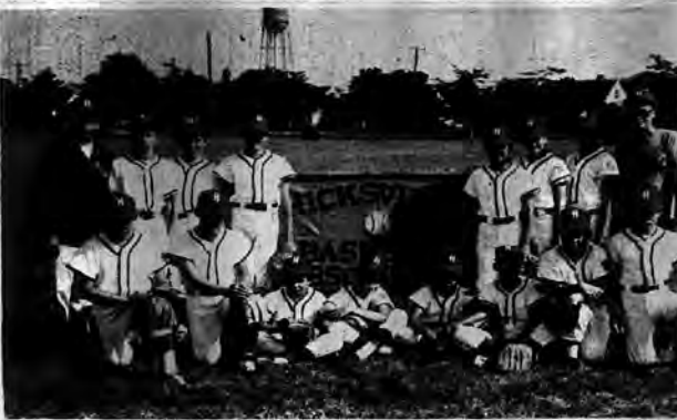
ALL STARS: Shown above, the Hicksville National Little League All Star Team, sponsored by the Hicksville Baseball Association.