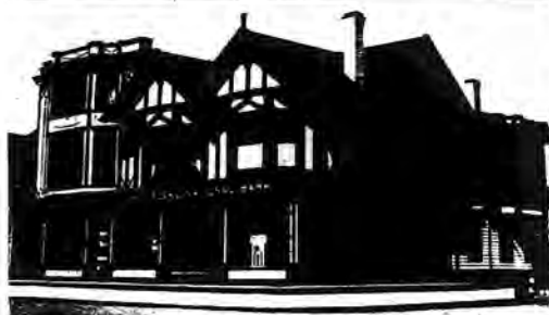
Original office of the Long Island National Bank dating back to 1917 still stands on Broadway and East Marie St. in Hicksville, although the main office of the bank has been housed elsewhere since 1924.