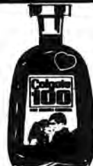
17 Oz. Reg. 1.49 Now 1.09